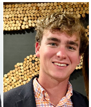
CAMP WYNN Clemson University