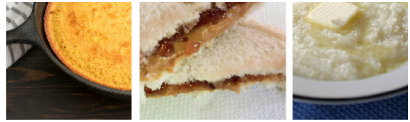
Benefitting the Hattie Duckett Food Pantry at the Phillis Wheatley Center