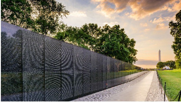
Vietnam Memorial looking towards Washington Monument