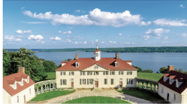
George Washington's Mount Vernon