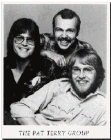
THE PAT TERRY GROUP